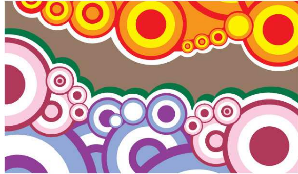
Design concept for the 2009 Flower Carpet.

The 2009 Fountain Square Flower Carpet abstractly represents the change of seasons from winter to spring. The circles which make up the design can symbolically be viewed in several different ways: simply as abstract flowers that bring color and vibrancy to spring, as ripples in water symbolizing both the rain of spring as well as the Genius of Water, the centerpiece of the square, or as the seed which changes and grows as it develops representing the potential of new life in spring. The use of circles also blends well aesthetically by visually mimicking the shape of the fountain, the café tables, and other curvilinear features of Fountain Square.